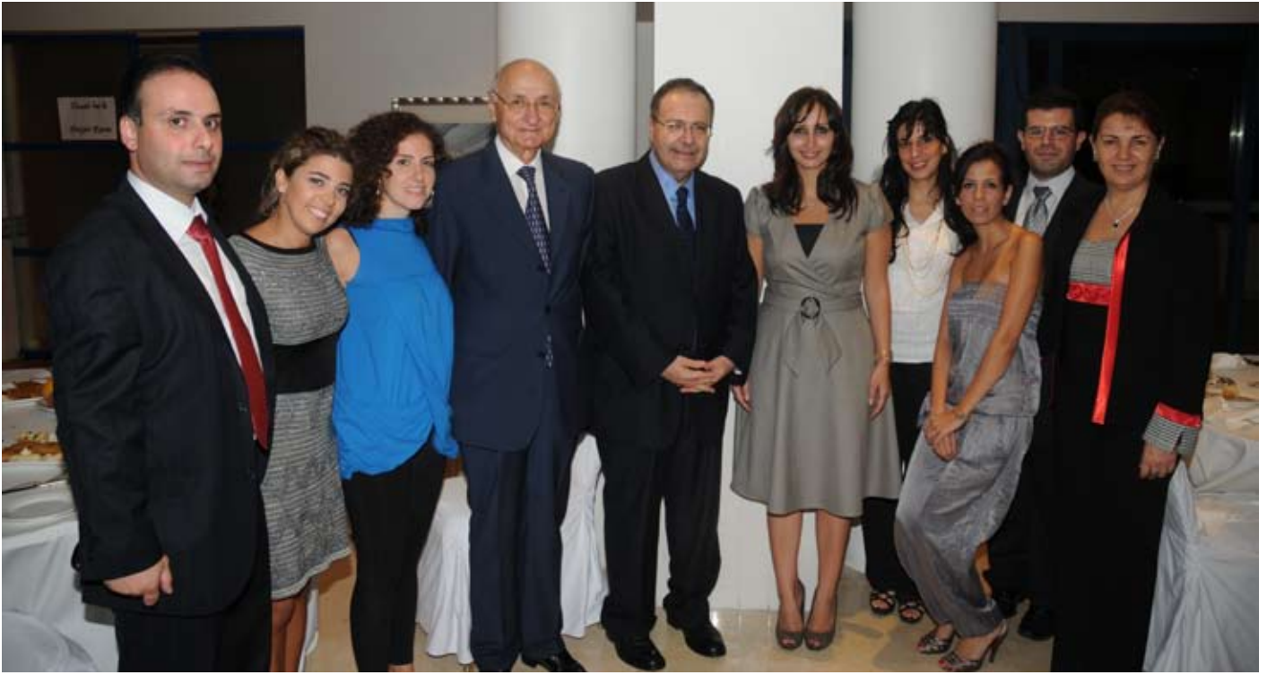
H.E. Minister of Information Tarek Mitri surrounded by Ambassador Khalil Makkawi and the LPDC team