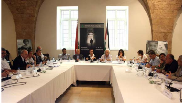
Right to work workshop

August 5, 2010. Beirut/ Grand Serail- The LPDC workshop aimed at clarifying basic concepts and assessing the proposed law amendments: the workshop was attended by representatives of the ministries of Justice and labor, National Fund for Social Security, Embassy of Palestine, ILO, UN